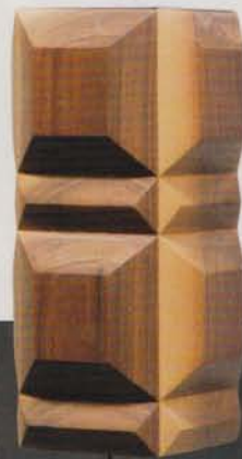
FAR LEFT New Collection 2013, Carousel light, photo: Marcus Peel LEFT New Collection 2013, Only Light Only Wood